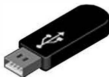
USB File Storage